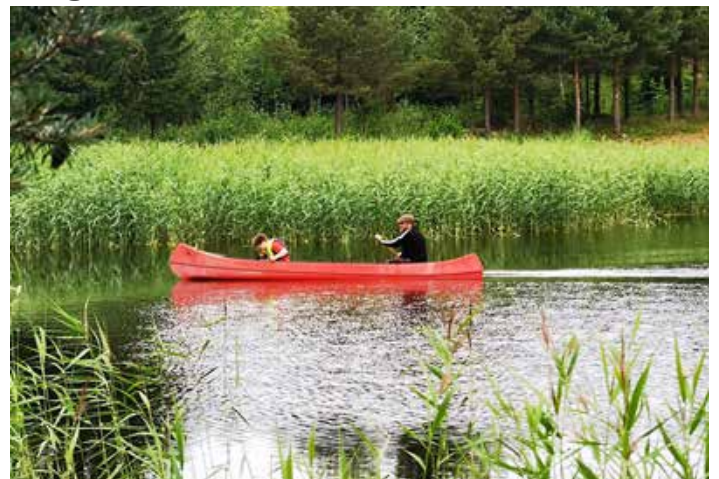
Summer in Vaasa