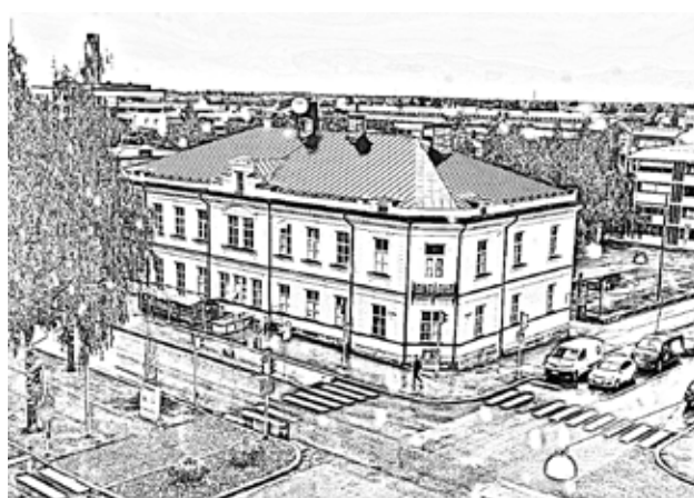
Last weeks house: The Pharmacy House, near the Church