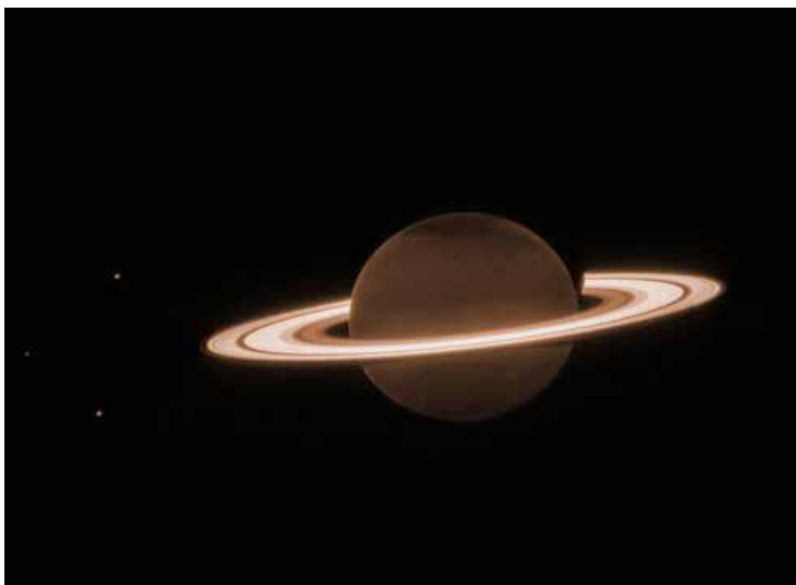
Next week: James Webb, space telescope

— Have you been faithful to me Karolina while I’ve been away? — Well then, but as I have become a communist, I probably also share a little of my love capital with others.