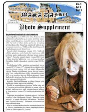
Photo Supplement on page 13