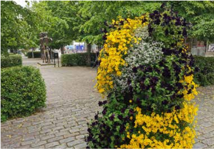
Flowers in Vasa. The city's horticulture department certainly does a wonderful job this spring. To make our city beautiful and pleasant!