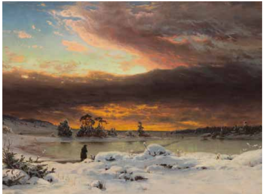
Fanny Churberg 12.12.1845, Vaasa 10.5.1892, Helsinki Winter Landscape, After Sunset, 1880 Finnish National Gallery Collection / Ateneum Art Museum