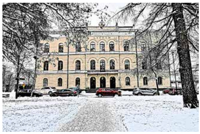
Viime viikon talo: The library in Palosaari PhitoScetch