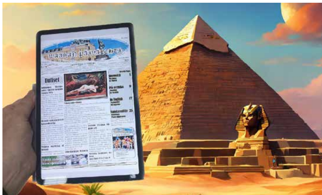
Like here, in Egypt

Environmental conditions are not favourable for reproduction. When the conditions are right, the adult bark beetles search up to half a mile in search of a vulnerable host. When they find the host, they drill through weakened bark to build tunnels where they can mate and lay eggs. They secrete pheromones to attract more individuals to the tree. Two to five weeks after contamination, they can migrate to another host and repeat the process. When the larvae hatch, they feed and pupate under the bark. Up to three generations can be produced per year.