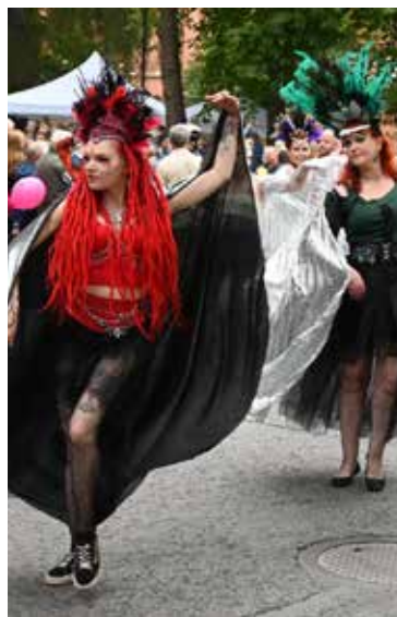
In Vaasa 15.8.2024

65230 Vaasa https://wasafuturefestival.fi/ NIGHT OF THE ARTS