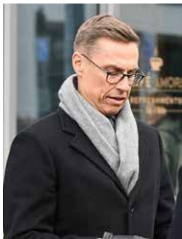
Alexander Stubb – International influencer and knowledge advocate