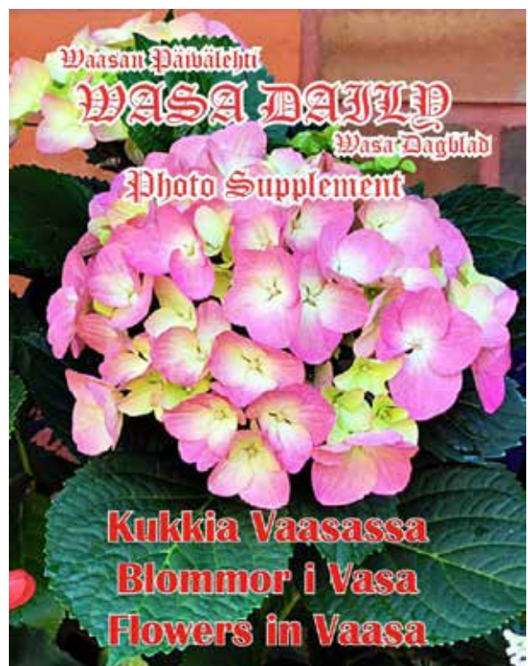
Photo Supplement - vpress.ovh

The University of Vaasa will organise its sixth conferment ceremony on 19–21 September 2024. The ceremony gives the University the opportunity to honour and recognise important scientific and social figures by awarding