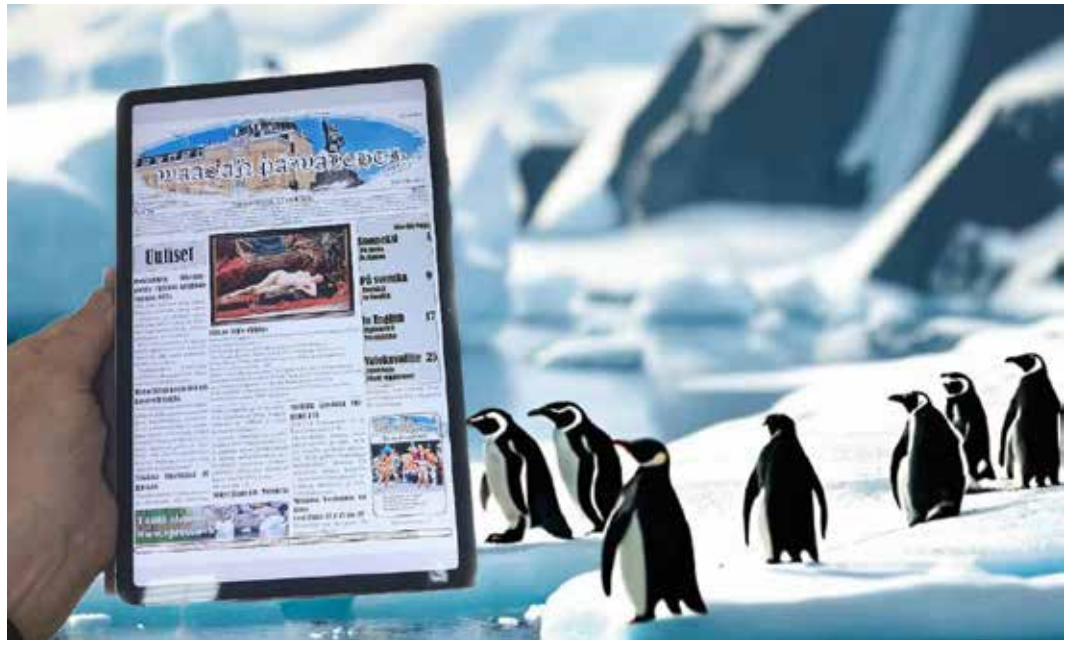
Like here, in Antarctis

that only people with skills and reliability of the conscription sys- This turnaround is excellent news experience corresponding to the tem. complexity of the situation are responsible for leading in particularly risky exercises.