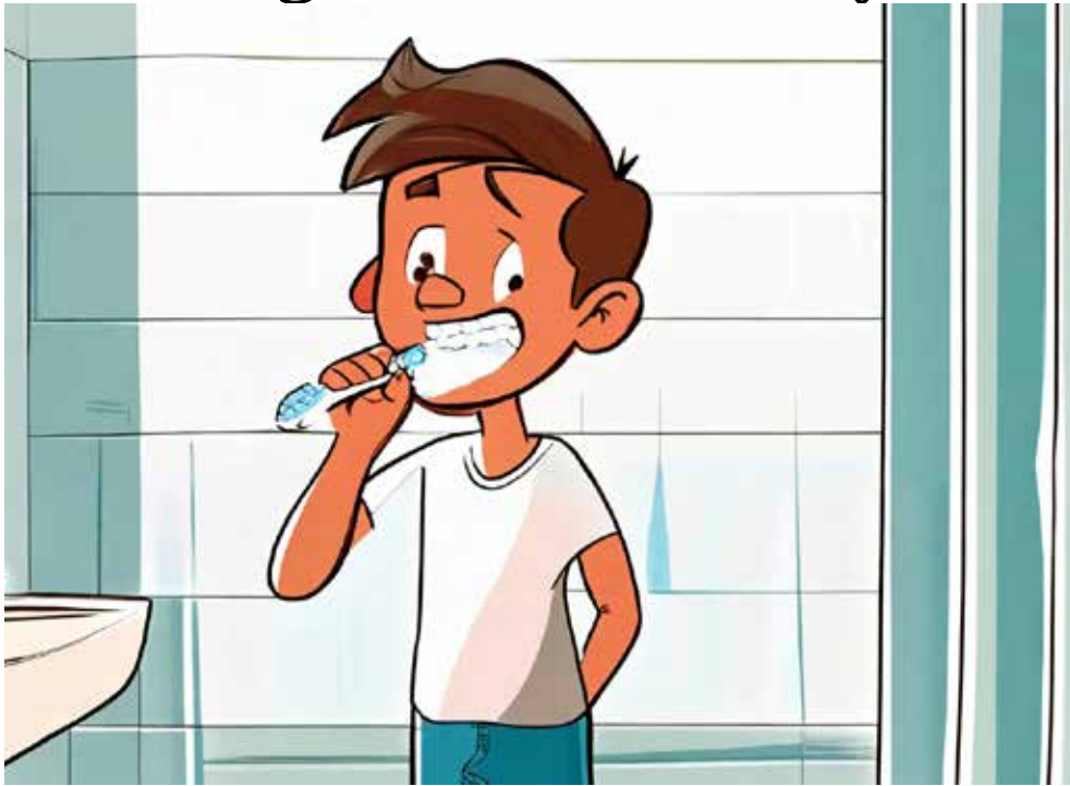
Prevention of stroke!

A new Finnish study has linked periodontitis, a serious form of gum disease, to an increased risk of stroke in young adults. The research, published in the Journal of Dental Research , found that people aged 18 to 49 with periodontitis were significantly more likely to suffer cryptogenic ischemic stroke (CIS), a type of stroke with unknown cause. The study also found a link between recent invasive dental procedures and an increased risk of stroke, especially in people with a heart defect called patent foramen ovale (PFO). Researchers believe that the inflammation caused by periodontitis may play a role in the development of blood clots, which can lead to stroke. Additionally, dental procedures can introduce