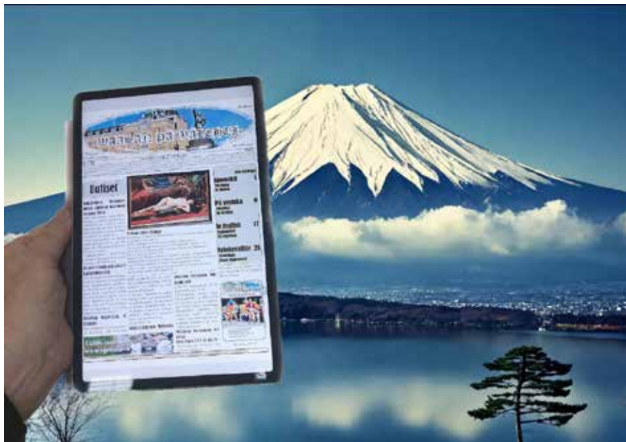
Like here near Mount Fuji in Japan

PM, we will show a children’s program on the stairs and give out free popcorn to the kids. There is also a new art exhibition in the foyer on the third floor. Ritz Lindy Hoppers will dance outside Ritz at 6:30 PM. More information and program details to come!