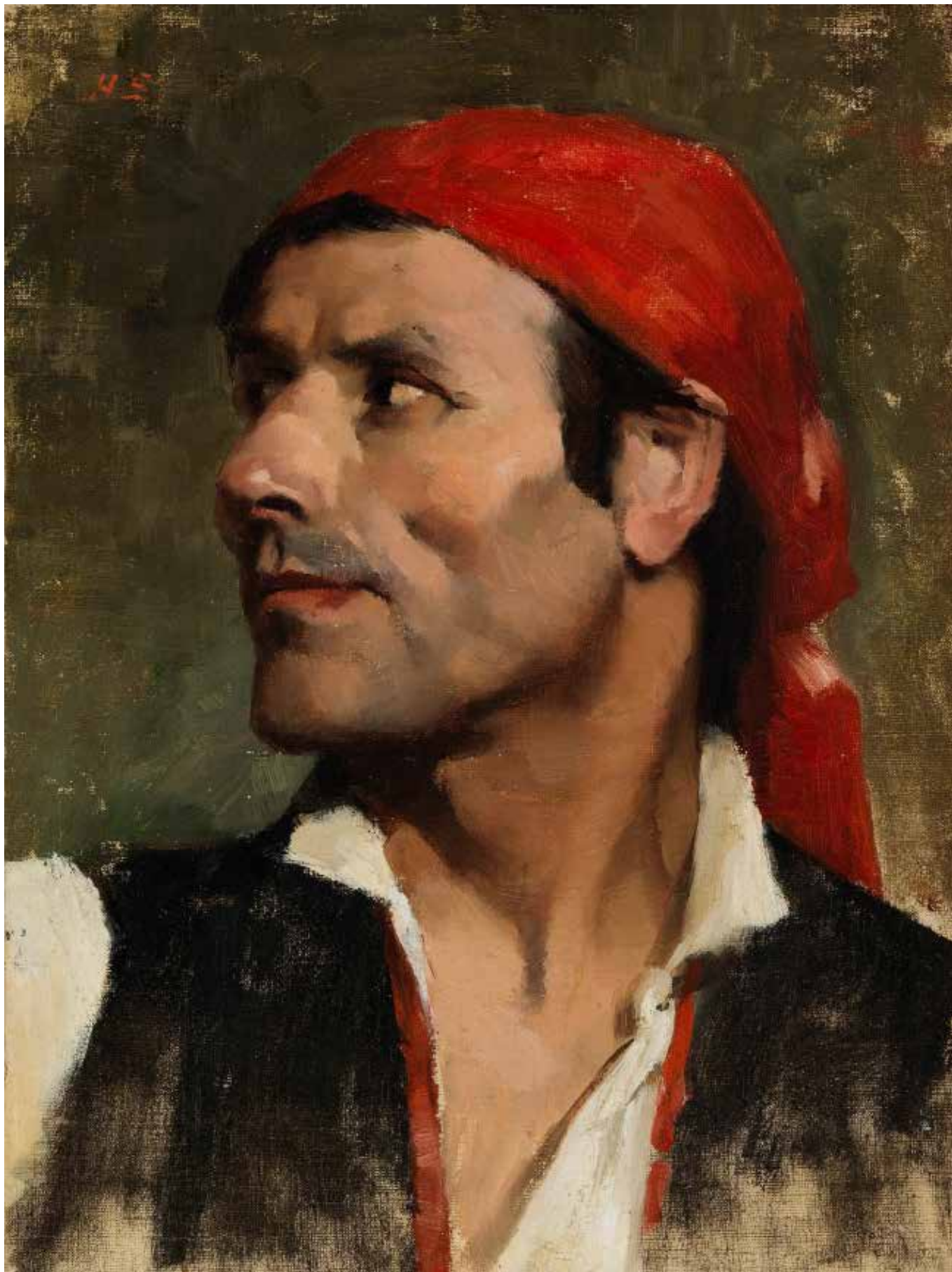
Helene Schjerfbeck 10.7.1862 - 23.1.1946 The Spaniard, 1881