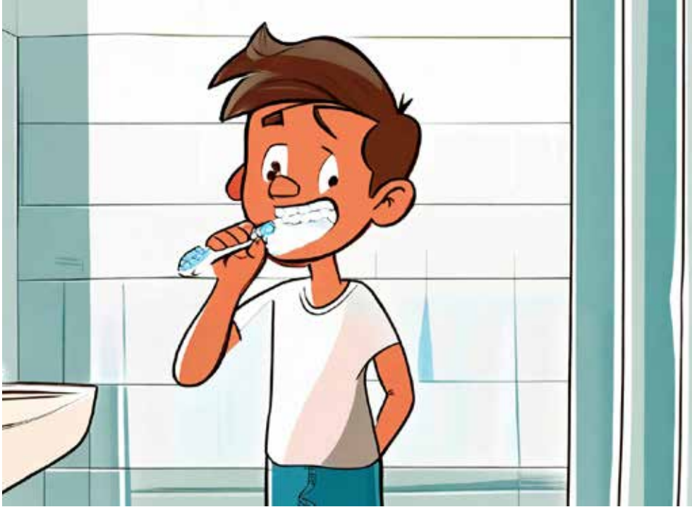
Prevention of stroke!

A new Finnish study has linked periodontitis, a serious form of gum disease, to an increased risk of stroke in young adults. The research, published in the Journal of Dental Research , found that people aged 18 to 49 with periodontitis were significantly more likely to suffer cryptogenic ischemic stroke (CIS), a type of stroke with unknown cause. The study also found a link between recent invasive dental procedures and an increased risk of stroke, especially in people with a heart defect called patent foramen ovale (PFO). Researchers believe that the inflammation caused by periodontitis may play a role in the development of blood clots, which can lead to stroke. Additionally, dental procedures can introduce