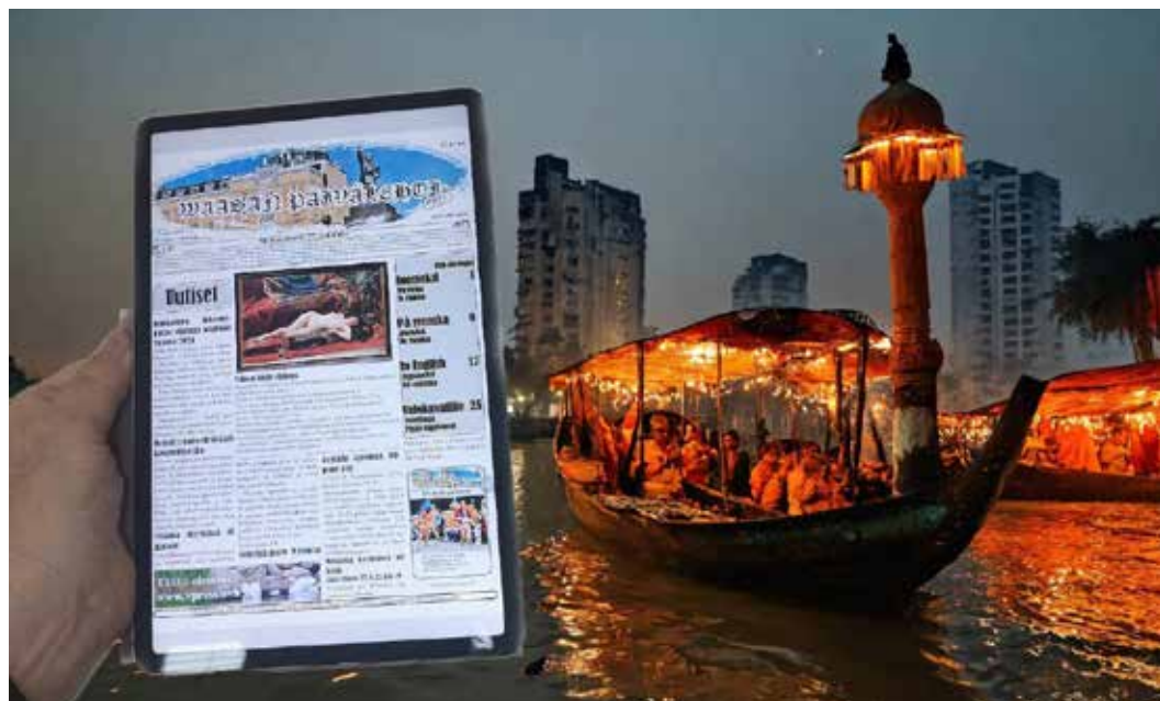
Like here in Dhaka, Bangladesh