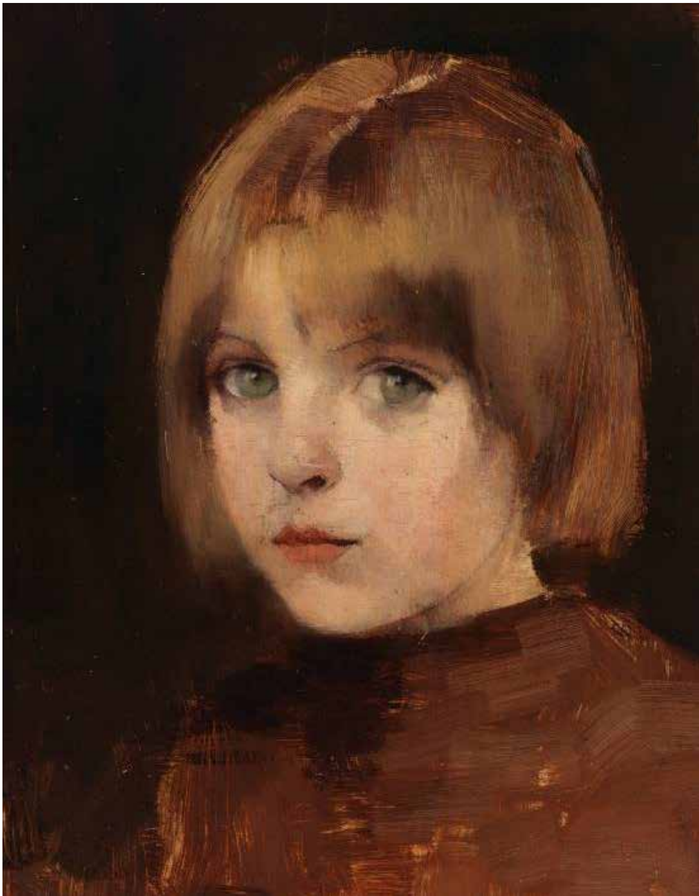
Helene Schjerfbeck 10.7.1862 - 23.1.1946 Head of a Girl, 1886