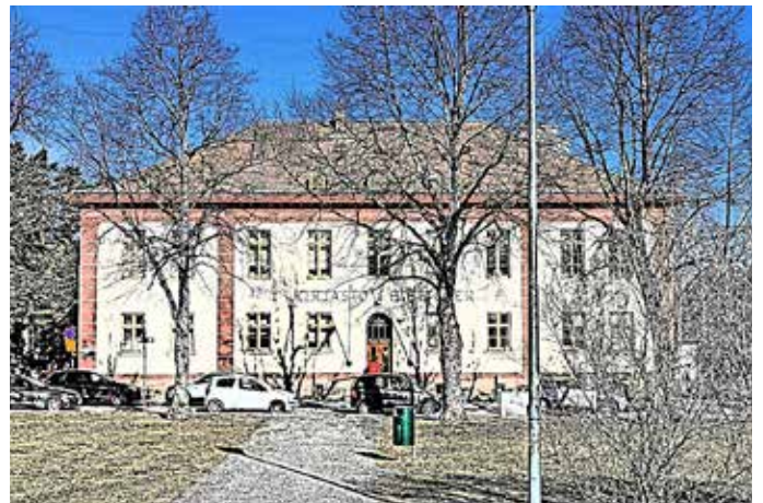
Viime viikon talo: An Iconic Ice-Cream Shop